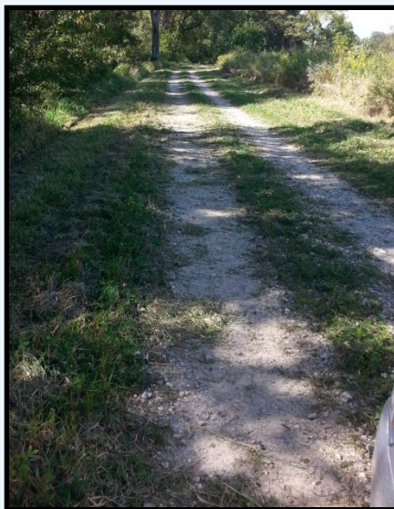
Previous Dirt Road Surface

Recently, 155 th Street was changed from a Level B county road to a conservation easement. This allowed the former dirt roadway to be converted to a new section of the Flint River Trail, filling a 1,700 foot gap in the middle of the existing trail. The new surface will make this a much better surface than the former county road.